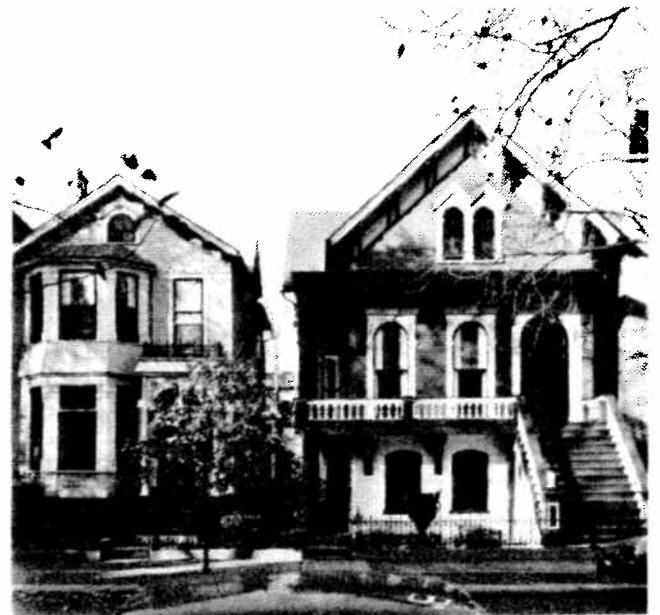
The Wacker homes, standing side by side on North Lincoln Park West, are particularly quaint. The "gingerbread" trim on the larger house is an exceptional example of the fine craftsmanship found in the construction of many of the homes in the district.

North Lincoln Park West is lined with other interesting buildings. One of the earliest is the apartment building to the north of the Wacker homes built by a brick manufacturer, Nathan Eisendrath, in 1873. Its formal character is derived from the French style window heads and plain treatment of the brick facade. To the south of the Wacker